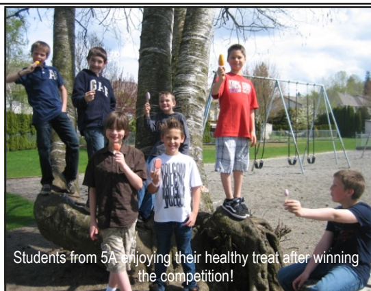
Students from 5A enjoying their healthy treat after winning the competition!

In Grade 5, students learn about the human body and their calling in 1 Cor. 6:20, "Honor God with your body." So, each Grade 5 class competed against the other Grade 5 classes in our Lunch Box Olympics. This fun, nutrition campaign was meant to encourage the students to make more nutritious food choices and teach healthy balance. During this competition, one parent commented that this was the first time their child wanted to eat vegetables at school!