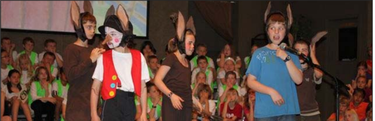
“ NO STRINGS ATTACHED” The Story of Pinocchio performed by Grades 1-5 - June 1 & 2